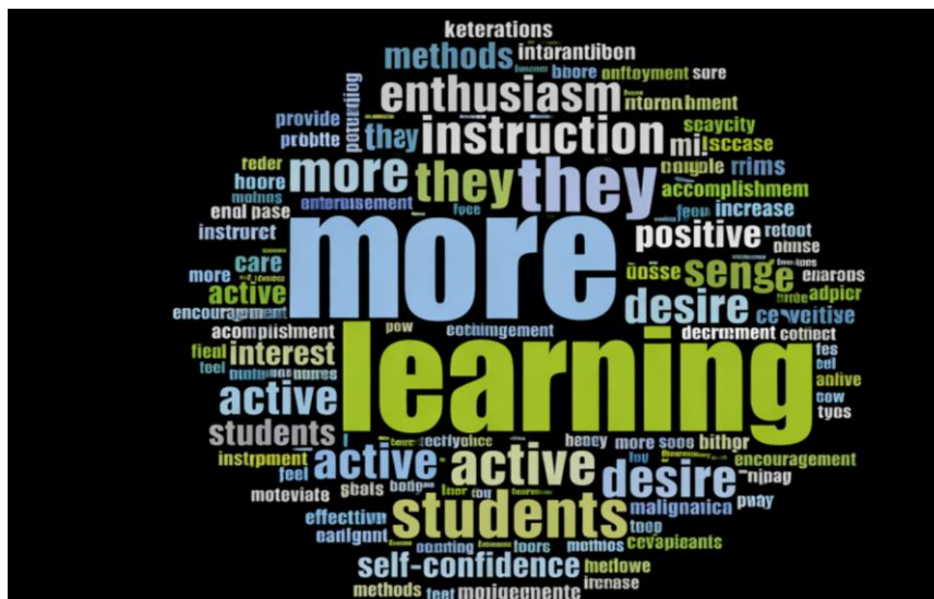
Figure 3. Word Cloud Visualization of Students’ Learning Motivation in Differentiated IPAS

This study examines students’ learning motivation in differentiated IPAS instruction on the topic “My Responsibility in Social Interaction.” The description of students’ learning motivation in this study was obtained through the analysis of interview, observation, and documentation data, which were subsequently processed and mapped using NVivo thematic coding. Based on the coding results, students’ learning motivation was analyzed in terms of observable behaviors during the learning process, the factors influencing motivation, and the impact of differentiation strategies on students’ engagement, persistence, and learning attitudes in the classroom. These findings are illustrated in the figure 3 .