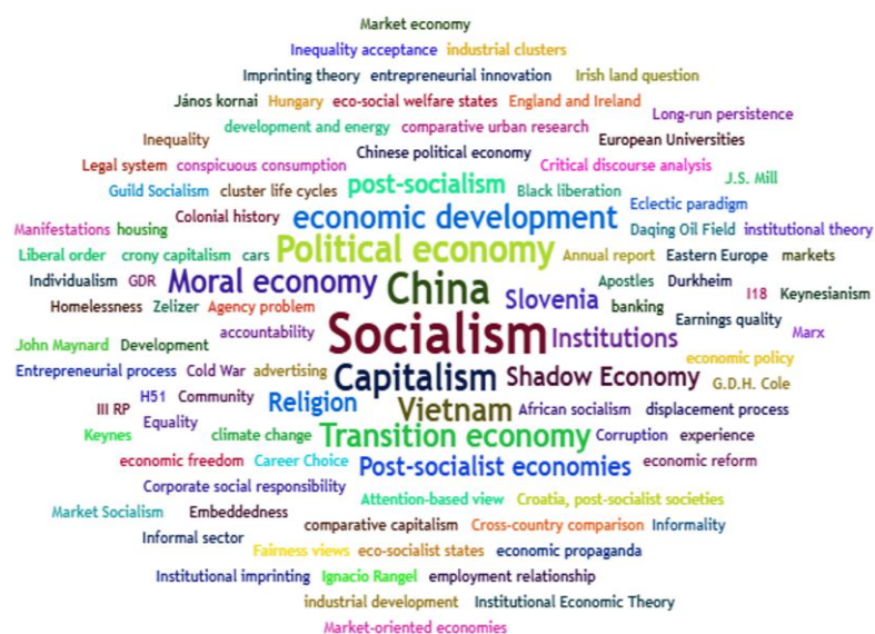
Figure 2. keyword structure

This section reports and interprets the results of the systematic review based on 43 Scopus-indexed journal articles. Rather than merely listing frequencies, the analysis is organized to mirror the Theory–Context–Method (TCM) logic established in the Introduction an intentional choice, because the review's novelty lies not only in mapping the field, but also in showing how theoretical commitments, empirical settings, and methodological decisions co-evolve in socialist economic research.